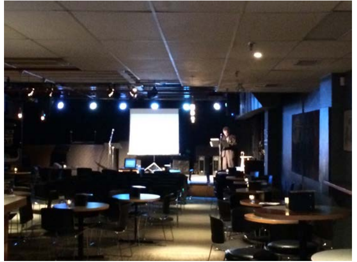
Setting up at The Bassment