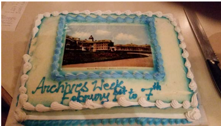
Always a good gathering where cake is involved