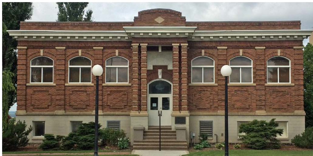
The Allan Sapp Gallery Today

It was Andrew Carnegie's philosophy that the library not only provide books, but also be a neutral territory in which community groups could meet and discuss ideas that would benefit themselves and enhance community life. Thus the basement of the library was originally composed of an auditorium and several smaller rooms used for a variety of public functions.