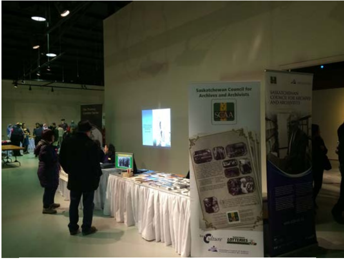
SCAA Table at heritage festival